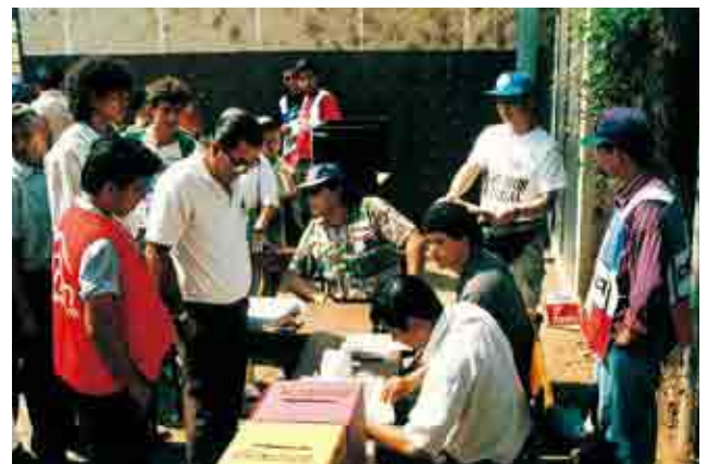
Observation at a polling station