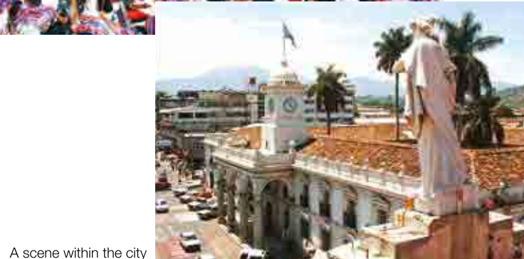
A scene within the city