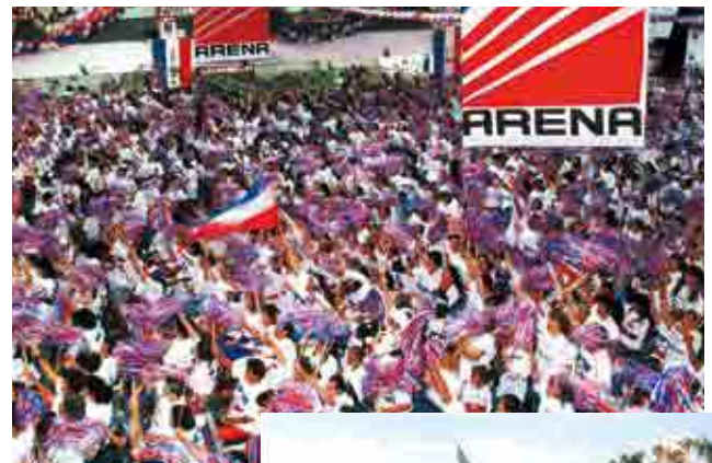
An election campaign scene

Japan dispatched 15 election observers—3 national government officials, 1 local government official, and 11 individuals from the private sector—to the UN Observer Mission in El Salvador (ONUSAL) to observe the presidential, legislative, and other elections held on March 20 and April 24, 1994. The Japanese observers were paired with observers from other countries. They monitored the preparation of polling stations, the electoral process, ballot collection, and ballot counting according to a checklist prepared by ONUSAL.