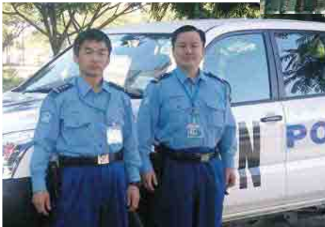
Civilian police officers of the United Nations Integrated Mission in Timor-Leste (UNMIT)