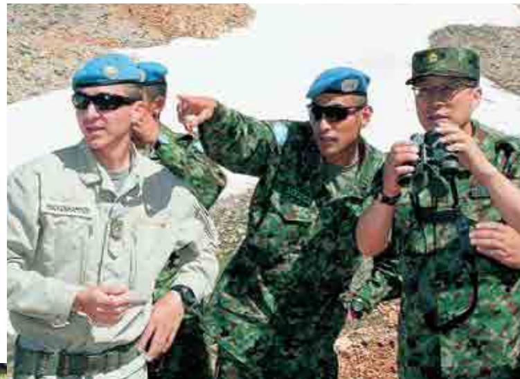
Staff officers of the United Nations Disengagement Observer Force (UNDOF) Headquarters

UN Peacekeeping Operations are activities undertaken by the UN to resolve conflicts around the world. In traditional Peacekeeping Operations, peacekeeping forces composed of national contingents of troops and cease-fire monitoring missions (in principle composed of unarmed military personnel) perform such tasks as monitoring cease-fires, separating hostile forces, and maintaining buffer zones. More recently, Peacekeeping Operations have expanded to include civilian police activities and administrative assistance activities, such as election and human rights monitoring, reconstruction and development, and organization and institution building.