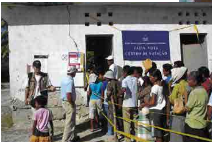
Election observers visiting a polling center (Timor-Leste, 2007)