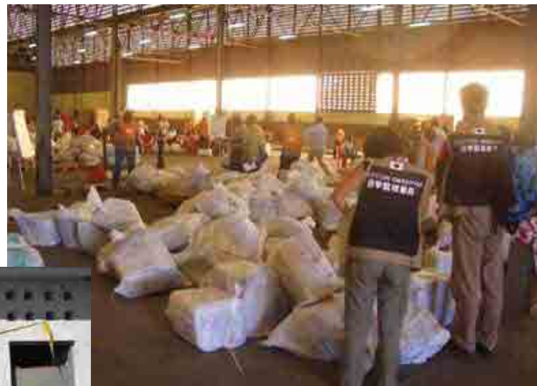
Election observers visiting a counting center (Democratic Republic of Congo)

International Election Observation Operations aim to ensure the fair execution of elections and other voting to establish a ruling apparatus by democratic means in areas disordered by conflicts. These operations are implemented outside the parameters of UN Peacekeeping Operations and are carried out by the UN, the Organization of American States (OAS), the Organization for Security and Cooperation in Europe (OSCE), and other regional organizations.