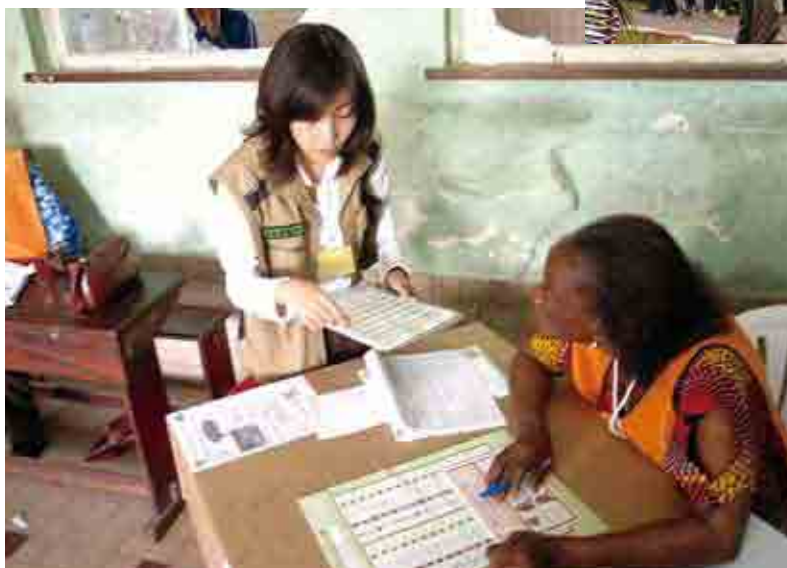
A Japanese election observer on duty